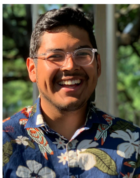
Mana Kindergarten Assistant and Development Communications Coordinator