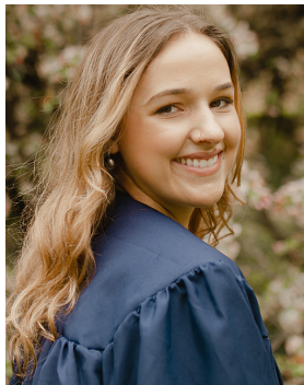
Isabel Theater/Drama Teacher

Because of God's faithfulness seen through your generous support we are now positioned to add Kindergarten and a Theater/Arts program next school year. Our plan is to be a K-8 school by 2023.